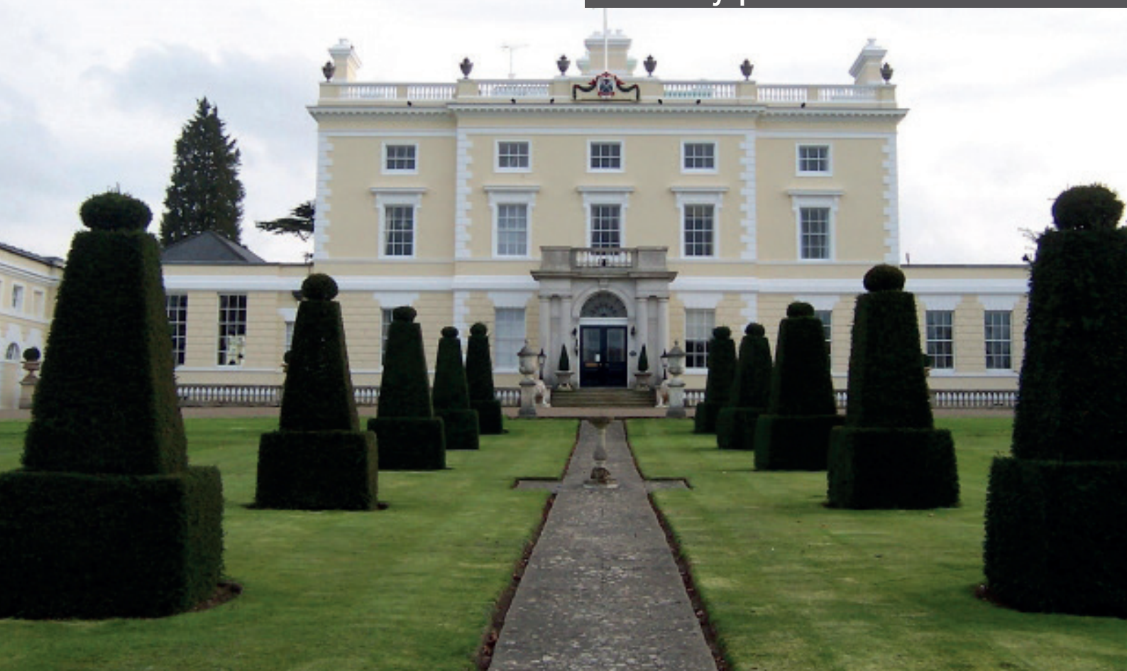
Norbury park house